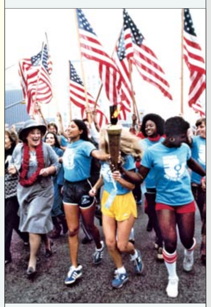
What changes have been made due to the movement for women's rights?