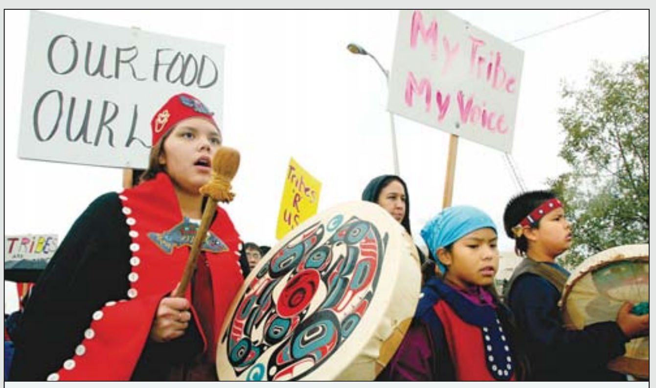
What civic purposes are served by public demonstrations?