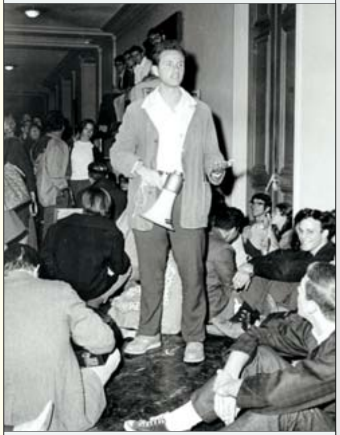
Should people be allowed to demonstrate by holding sit-ins in public buildings? Why or why not?