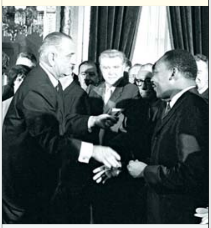
What events led to President Johnson signing the Voting Rights Act of 1965?

Outlaw discrimination in hotels, restaurants, theaters, gas stations, airline terminals, and other places of public accommodation