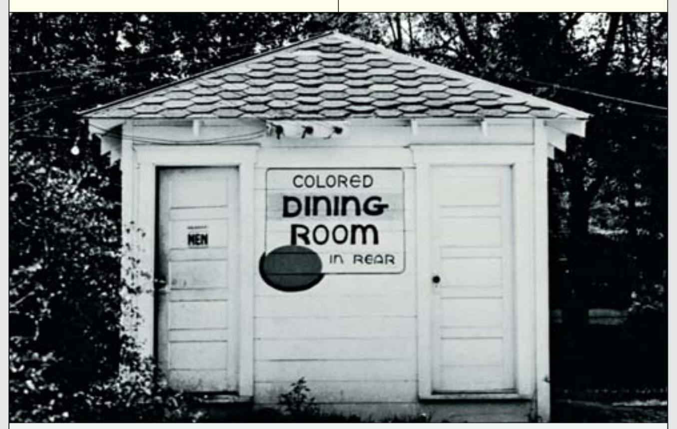
What democratic principles are violated by de jure and de facto segregation?

Still, in the 1950s racial segregation and discrimination were deeply entrenched. African Americans and other non-whites were treated as second-class citizens. A web of state laws and local ordinances mandated de jure segregation in almost every aspect of public life, including schools, street-cars and buses, toilets, and drinking fountains. In some