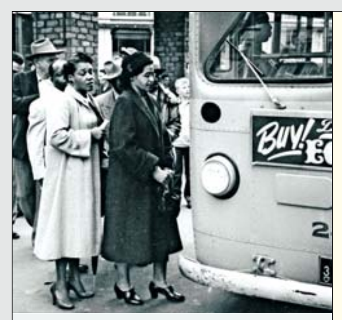
What were the results of the refusal of Rosa Parks to give up her seat to a white man on a city bus in Montgomery, Alabama in 1955?

boycott of the Montgomery bus system. Martin Luther King Jr., a young minister in Montgomery, helped lead the year-long boycott, which ended when the Supreme Court ordered Montgomery city officials to end segregation on city buses.