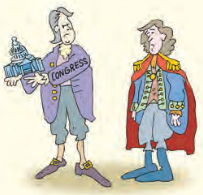
Why did the Framers allow for the impeachment of presidents?

president guilty, he or she can be removed from office. While it is rarely used, impeachment is an important power that Congress has for checking the power of the executive branch.