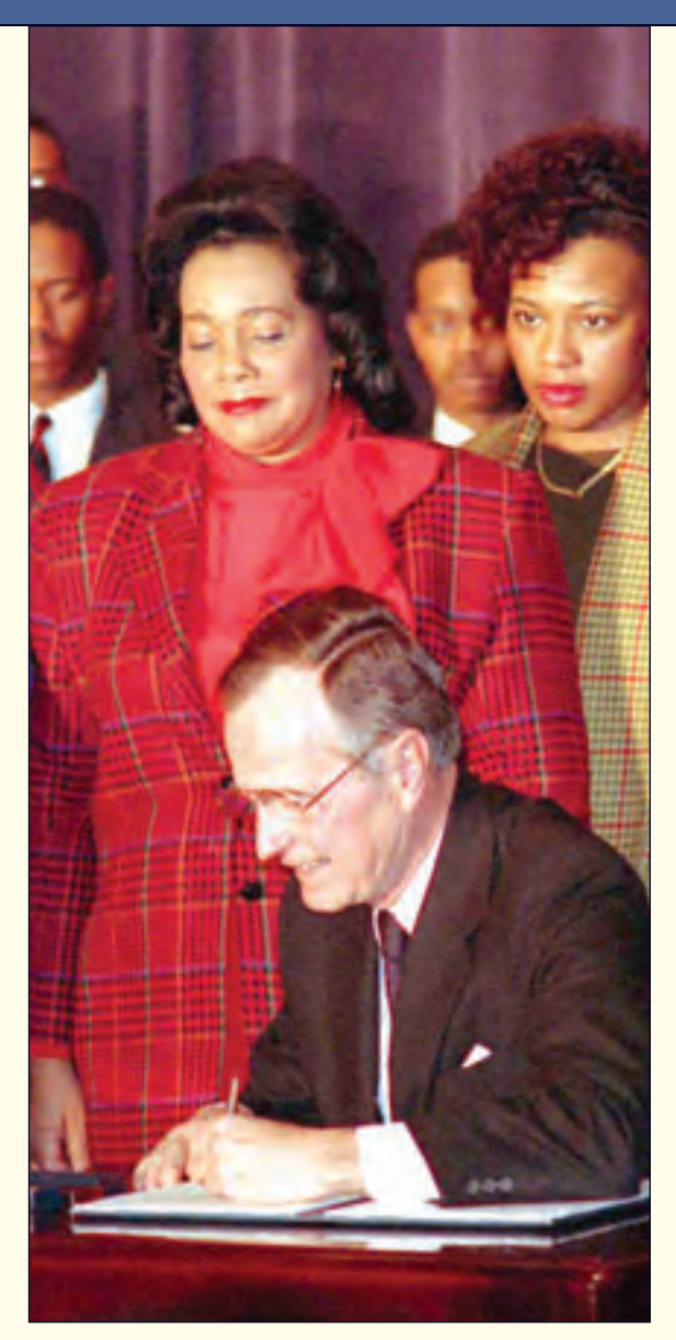
What powers does Article II of the Constitution grant to the president?

Article II of the Constitution created the executive branch. The Framers wrote Article II in more general terms than they did Article I. As a result, Article II is shorter.