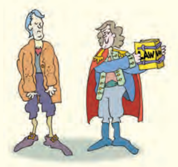
Why did the Framers allow presidents the power to veto laws passed by Congress?

The Constitution provides another important way to limit the power of the president and prevent the abuse of power. It gives the House of Representatives the power to impeach the president. To impeach means "to bring to trial." This means the House can accuse the president of serious crimes. The Senate then holds a trial. If the Senate finds the